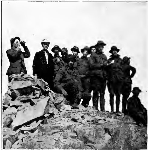
M. I. A. SCOUTS, AMERICAN FORK